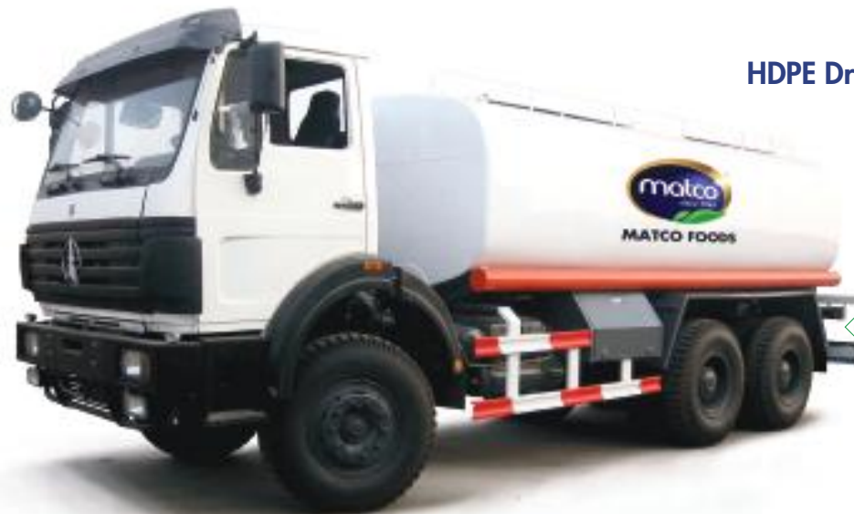
SS Tanker (Bulk Buying) 18 Tons /30 Tons

We practice flexibility in packaging whilst adhering to international standards, offering customized packaging options with High Density Polyethylene (HDPE) drums, HDPE jerry cans, Stainless Steel tankers for bulk buying and Integrated Bulk Carton (IBC) containers with pallets and shrink wrapping.