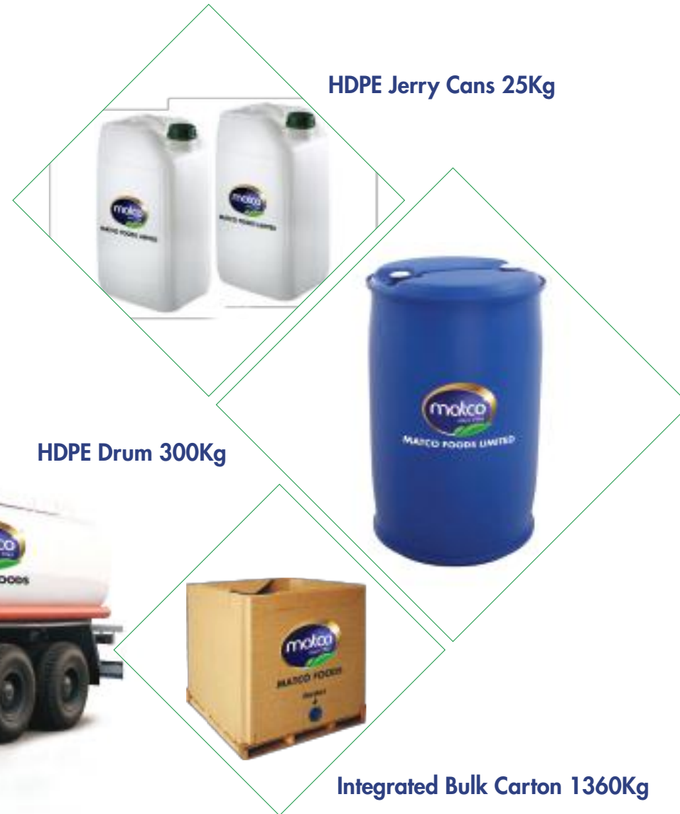
HDPE Jerry Cans 25Kg